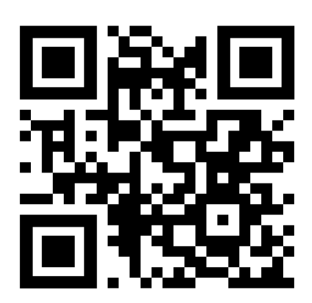
6-7 Year Old Campers: